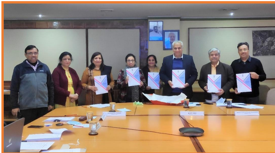
Launching new issue of Kalakriti

The Commission had till the year 2011-12 been maintaining its Annual Accounts on accrual basis except for salary. As per advice of Audit, the salary component is also now being maintained on accrual basis from the year 2012-13.